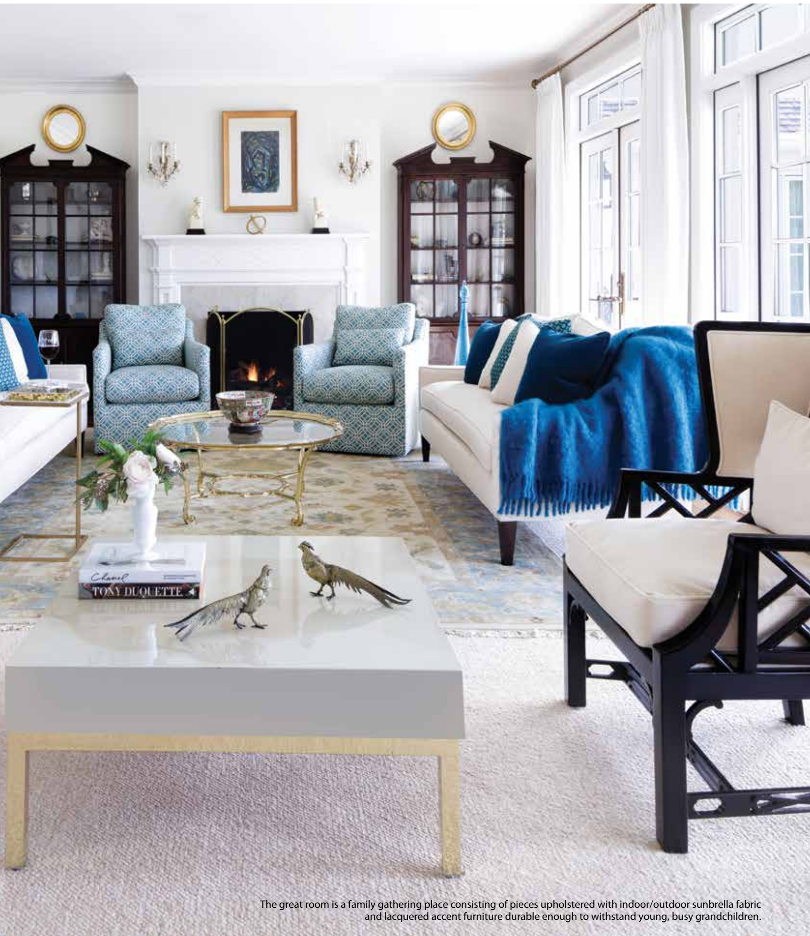
The great room is a family gathering place consisting of pieces upholstered with indoor/outdoor sunbrella fabric and lacquered accent furniture durable enough to withstand young, busy grandchildren.