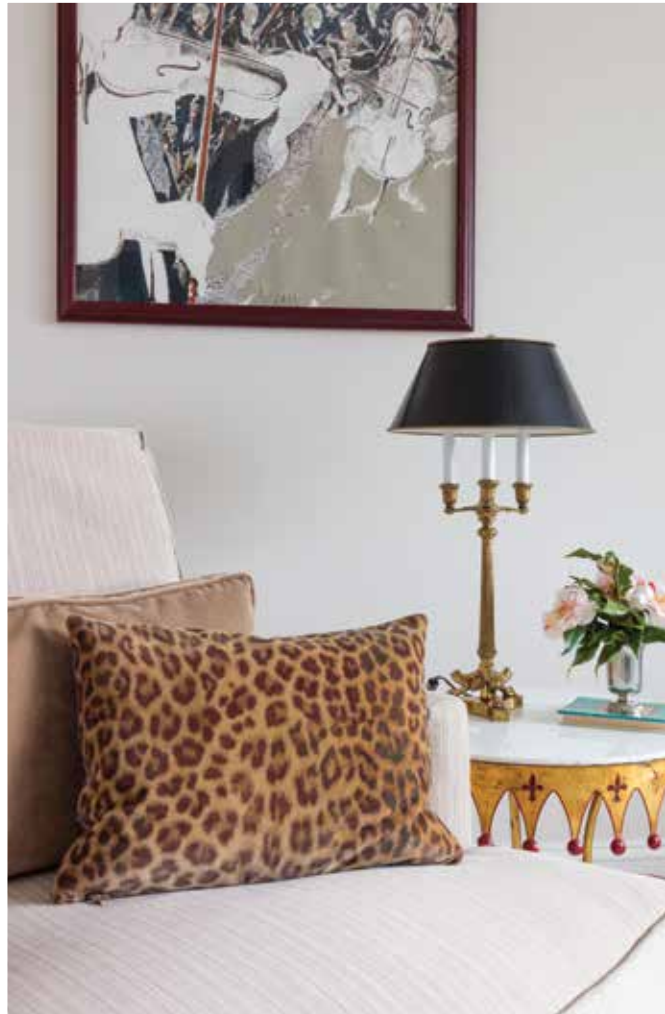
Right: A touch of New Orleans in the jazz artwork, along with a whimsical leopard pillow, adorns the master bedroom sitting room. Bottom: Sitting and work area in master bedroom provides a clear view of the fairway from the campaign desk.