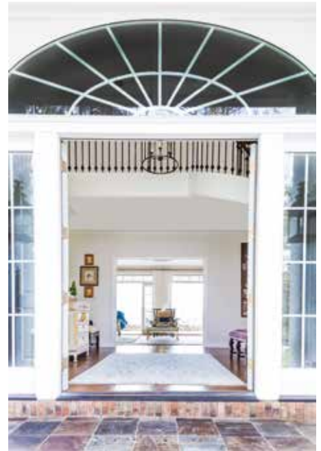
Top: Lazy days of summer are enjoyed on the expansive outdoor porch at the back of the house. Bottom: An auspicious entry sets high expectations and leads to an interior with grace and style that is both elegant and relaxed.

A home, it is said, is always an extension of self. Sometimes, if you are lucky, you find an interior designer who understands this and is willing to not only work with you but also during the process becomes your friend and confidant. She helps