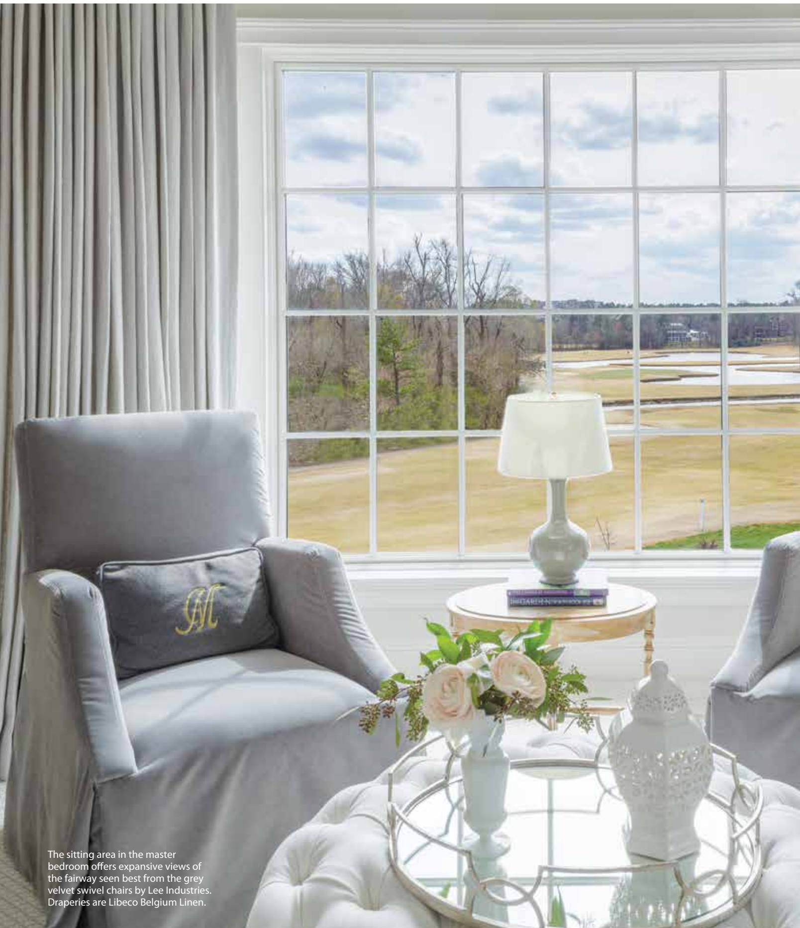
The sitting area in the master bedroom offers expansive views of the fairway seen best from the grey velvet swivel chairs by Lee Industries. Draperies are Libeco Belgium Linen.