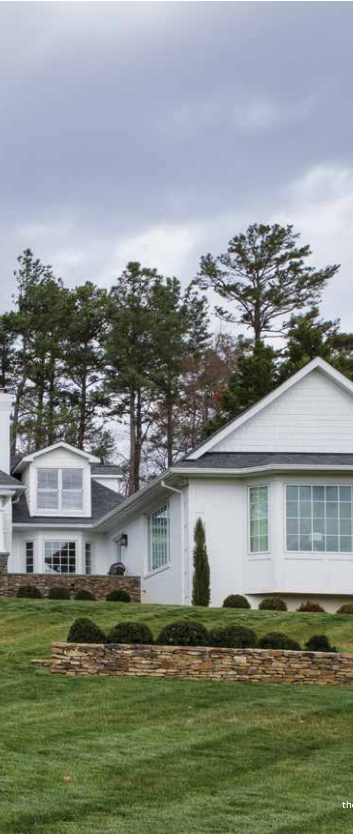
View from the backyard adjoins the tenth and eleventh fairways in this dramatic golf course home.