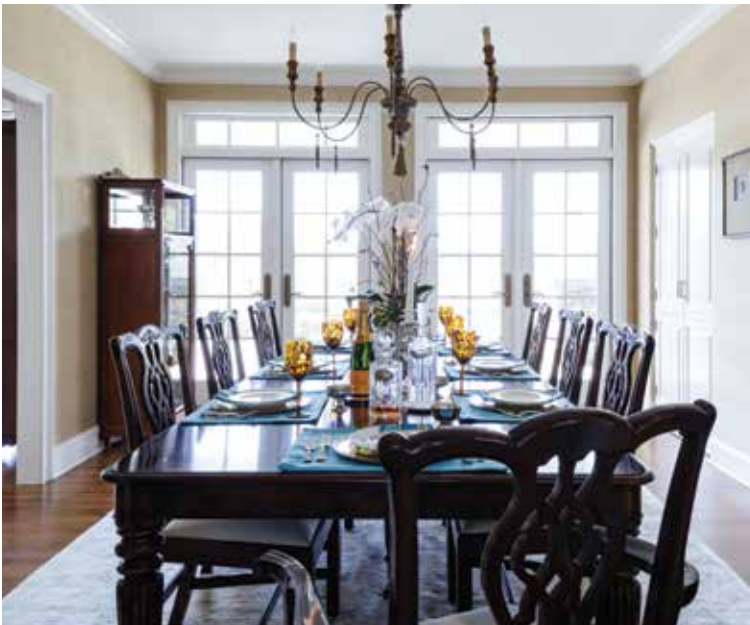
Top: A neutral-hued kitchen designed by Mary Leibold of The Kitchen Specialist in Durham is streamlined, functional and fully integrated with a commercial range. The allure and beauty of Taj Mahal Quartzite counters were irresistible and used exclusively to provide for convenient and easy maintenance. Cream cabinets and handmade Italian subway tile backsplash complete the look.