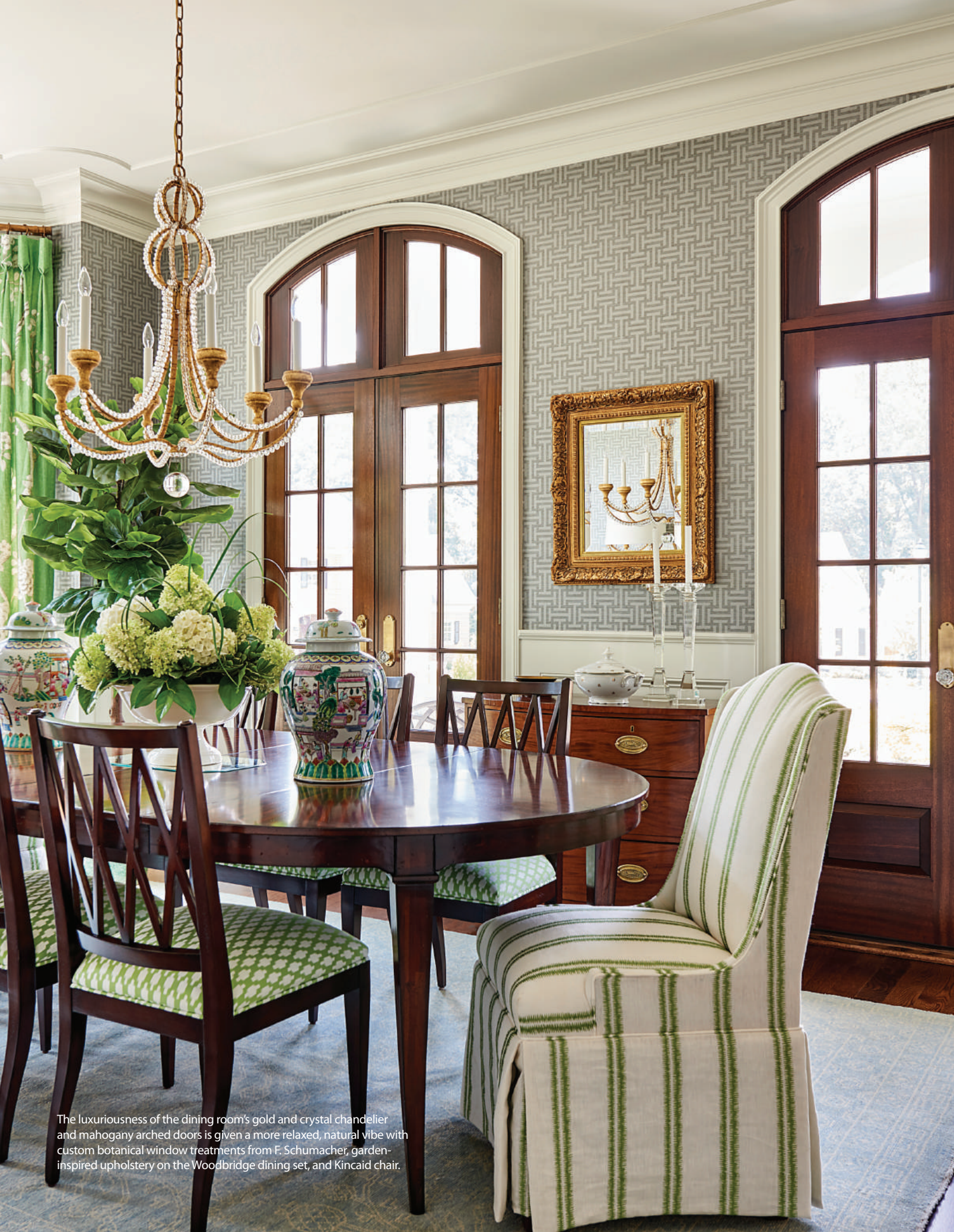
The luxuriousness of the dining room's gold and crystal chandelier and mahogany arched doors is given a more relaxed, natural vibe with custom botanical window treatments from F. Schumacher, garden-inspired upholstery on the Woodbridge dining set, and Kincaid chair.