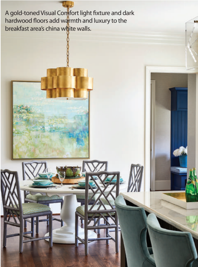
A gold-toned Visual Comfort light fixture and dark hardwood floors add warmth and luxury to the breakfast area's china white walls.