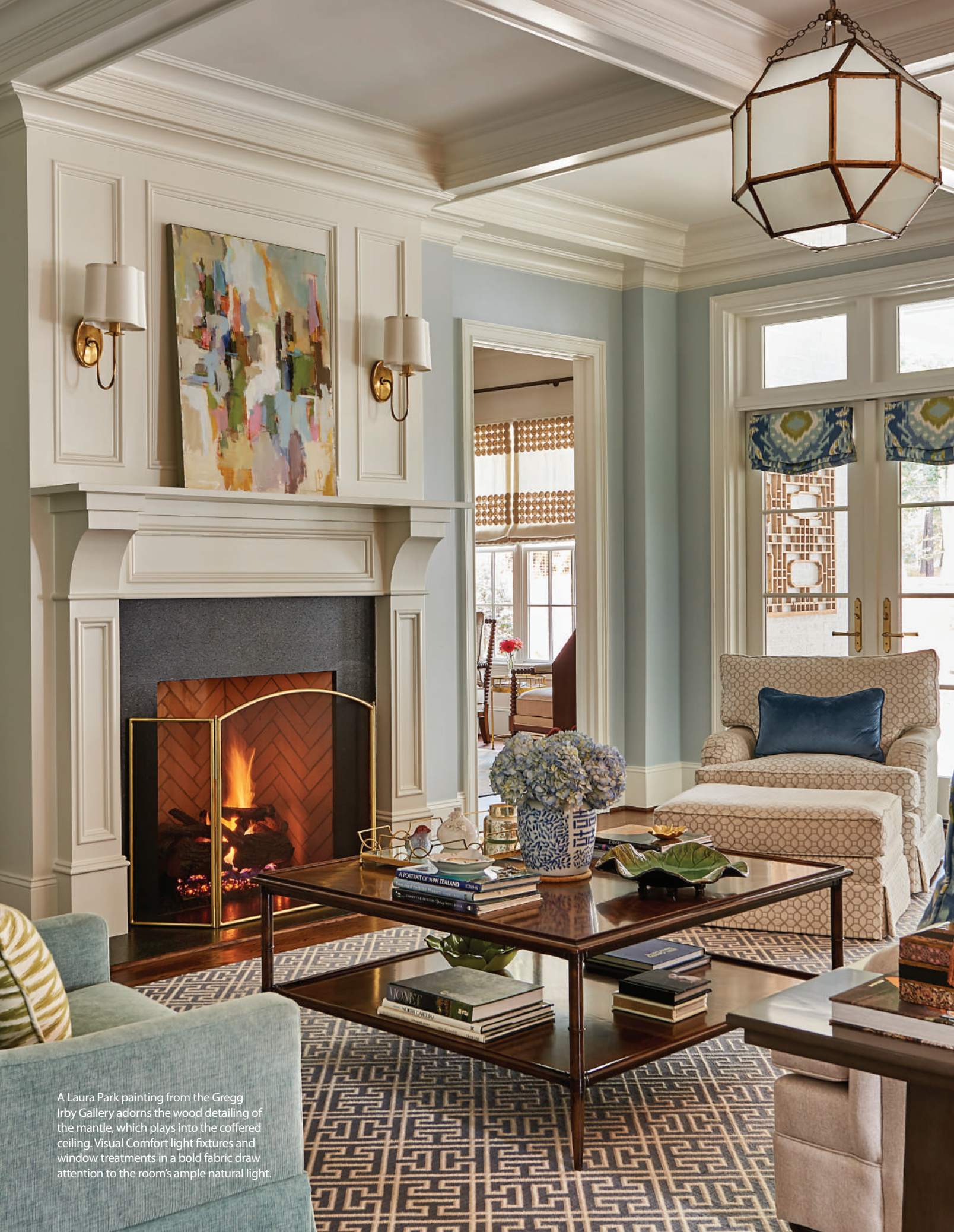
A Laura Park painting from the Gregg Irby Gallery adorns the wood detailing of the mantel, which plays into the coffered ceiling. Visual Comfort light fixtures and window treatments in a bold fabric draw attention to the room's ample natural light.