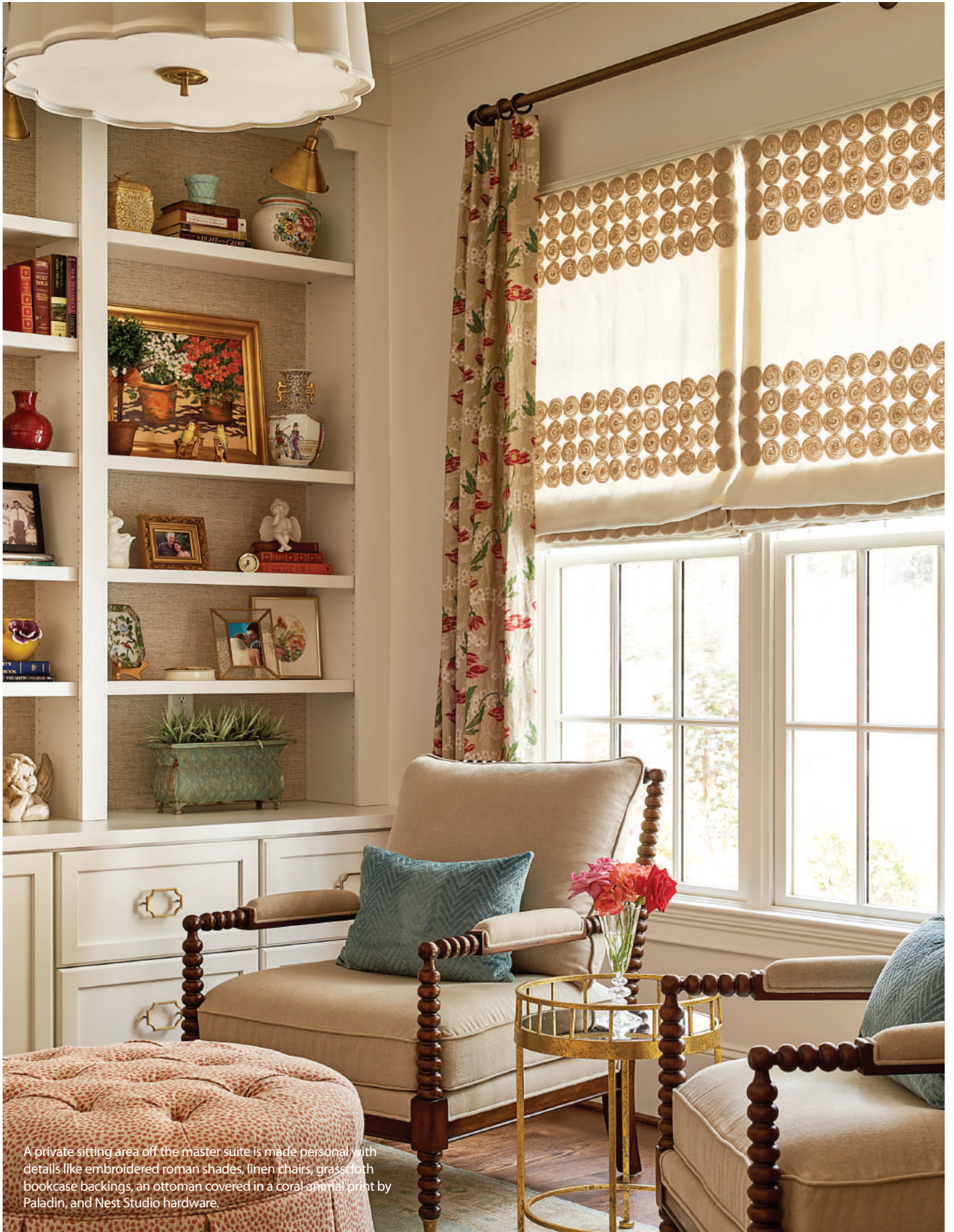
A private sitting area off the master suite is made personal with details like embroidered roman shades, linen chairs, grasscloth bookcase backings, an ottoman covered in a coral animal print by Paladin, and Nest Studio hardware.