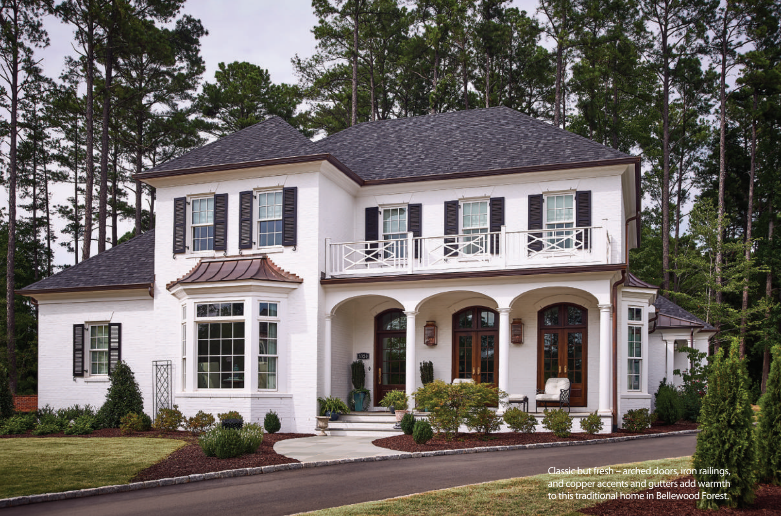
Classic but fresh – arched doors, iron railings, and copper accents and gutters add warmth to this traditional home in Bellewood Forest.

Situated in Raleigh’s exclusive Bellewood Forest community in the heart of the Beltline, which was developed by Williams Realty and Building, the home’s spacious lot, complete with manicured lawn and landscaping, as well as a stand of stately pines, proved to be just the starting point. The home’s traditional white painted brick and black shutters are warmed with copper accents and gutters, iron railings, and distinctive arches and porch columns. The outdoor back patio features gray tiled floors, an outdoor fireplace, and plenty of comfortable resin wicker seating where guests can relax and enjoy the yard. Unobscured sight lines from the front door to the rear patio create continuity, blurring the lines between outside and in. “The exterior of the home sets the aesthetic for the design and perfectly embodies the homeowners’ personality—classic with a fresh twist.” Gammons says.