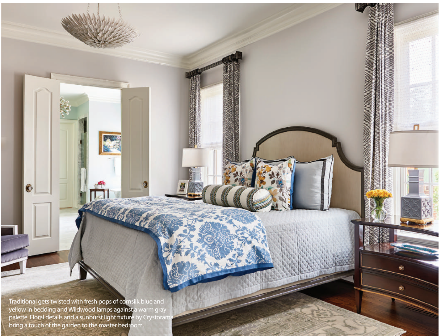
Traditional gets twisted with fresh pops of cornsilk blue and yellow in bedding and Wildwood lamps against a warm gray palette. Floral details and a sunburst light fixture by Crystorama bring a touch of the garden to the master bedroom.

And though the design celebrates the fresh, crisp vigor of nature, it's the little details that truly accentuate the home's elegance. The rich, dark stain on the arched doors, the crystal accents on the dining room chandelier, the Lucite handles in the butler's pantry, the crystal knobs in the powder room, and the mirrored sconces in the master bath all add subtle hints of glamour throughout the home. The gold finishes of mirrors, frames, accessories, and hardware impart a luxurious warmth in every room and is reflected in the light fixtures' high-impact contemporary styles.