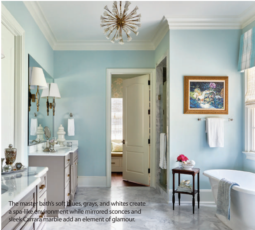
The master bath's soft blues, grays, and whites create a spa-like environment while mirrored sconces and sleek Carrara marble add an element of glamour.

of bright yellow and a cornsilk blue-and-white duvet in the master bedroom infuse the otherwise neutral space with a splash of color. Geometric designs on the master bedroom curtains and the adjacent sitting room's embroidered roman shades add a harder edge to the softer nature-inspired prints. The bold blue and green geometric print of the family room's valances kicks up the drama for more traditional furniture.