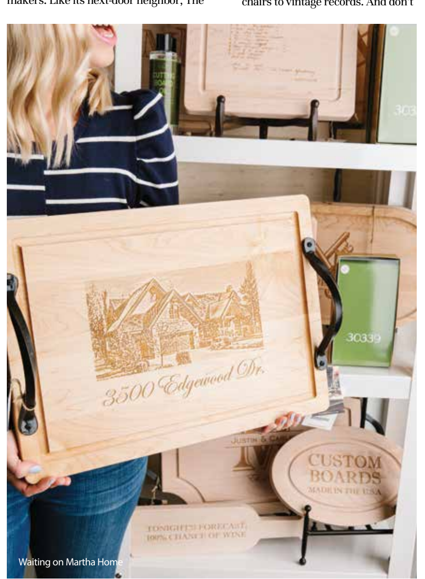
50 HOME DESIGN & DECOR CHARLOTTE | DECEMBER 2019