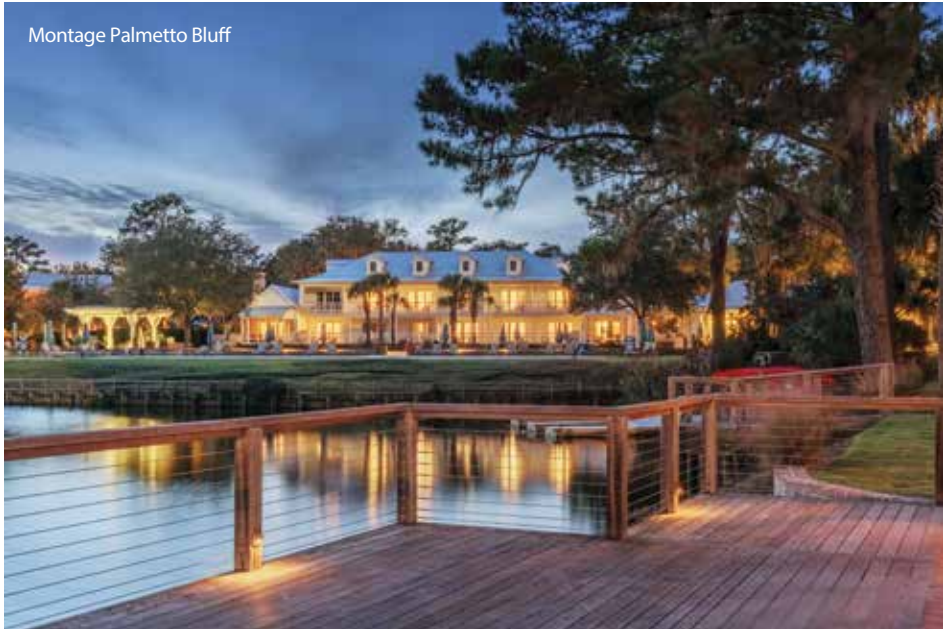
Montage Palmetto Bluff