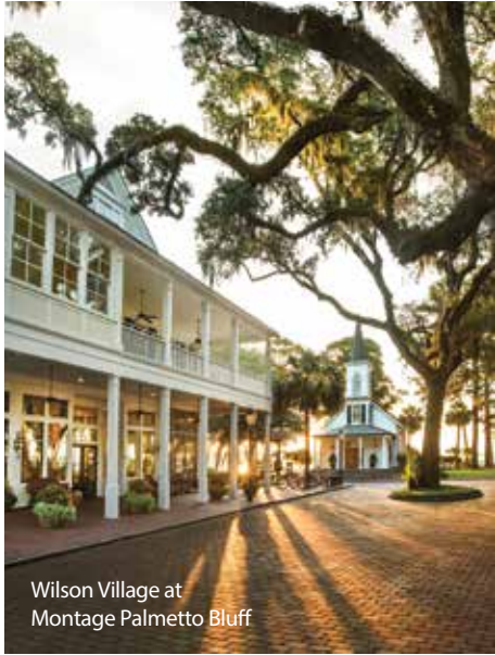
Wilson Village at Montage Palmetto Bluff