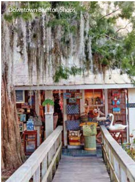
Downtown Bluffton Shops