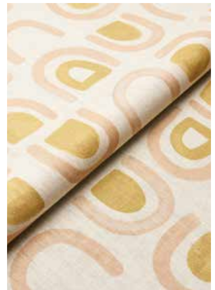
CLOCKWISE FROM TOP LEFT: CLÉ; SCHUMACHER, UNIVERSAL FURNITURE

In this distinctive collaboration with Schumacher, Washington, DC, artist and designer Hadiya Williams has harnessed the relationship between Black people and their ancestral lineage, history, and rituals as it moved across the diaspora. The translated pieces result in an artfully graphic rendition of lineal-based designs, full of movement and centered on the interpretation of art and culture colliding. fschumacher.com